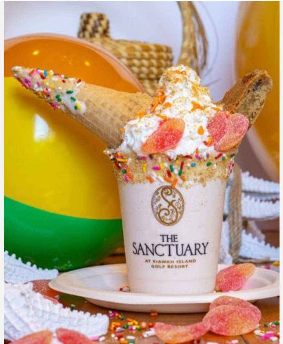
Beaches & Cream at the Kiawah Island Resort offers loaded milkshakes like this one, the Peaches & Beaches.

Lowcountry Eat Out! Facebook group went from pandemic whim to Charleston restaurant savior