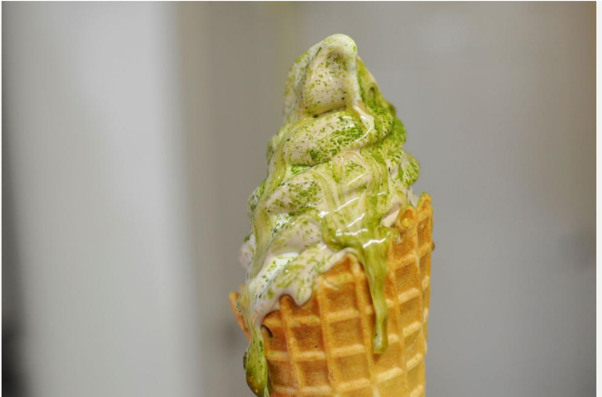
Kinfolk's soft-serve ice cream can be topped with items like matcha and honey or Ghost Reaper sugar.