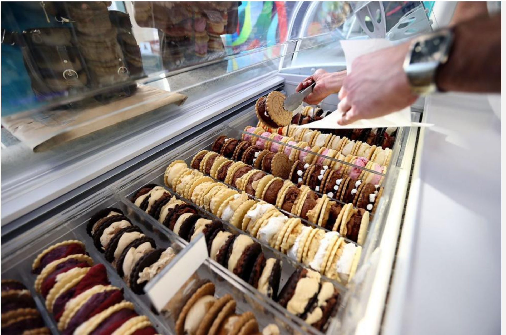
Peace Pie ice cream sandwich shop is located on Meeting Street, between Hasell and Market streets.