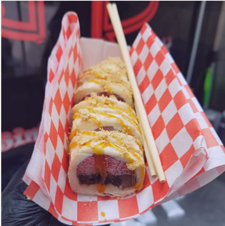
Holy Rolly's ice cream sushi roll.